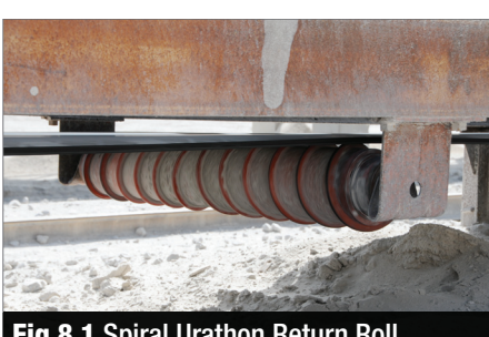
Fig 8.1 Spiral Urathon Return Roll

Yes, however it involves removing the weld on the retaining ring in order to slip the discs off the shafts.